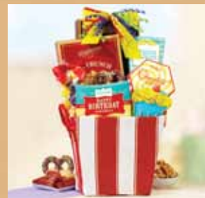
Birthday Delight 97791