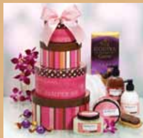
Pamper Her Spa Tower 95710